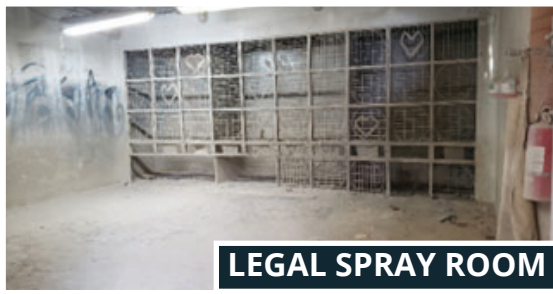
LEGAL SPRAY ROOM